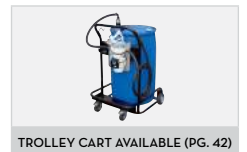
TROLLEY CART AVAILABLE (PG. 42)